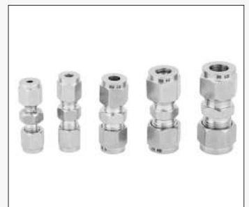
Compression Tube Fittings